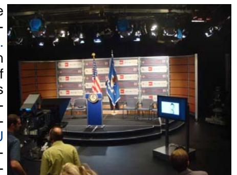
The studio where announcement took place